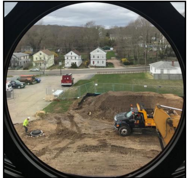
The construction site in July through a transept window of the church.

In April, work began on Phase II of the reconstruction with money we had already raised. We have been working on the rough-in for the electrical and